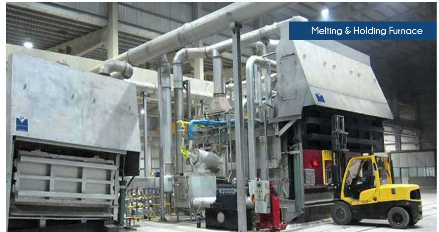
Melting & Holding Furnace

Subsequently the hot metal is solidified in the shape of strips, in coil form. It drops to a temperature of 300 C° and trimmed in the caster machine with on line edge milling for the next multi-stage rolling mill.