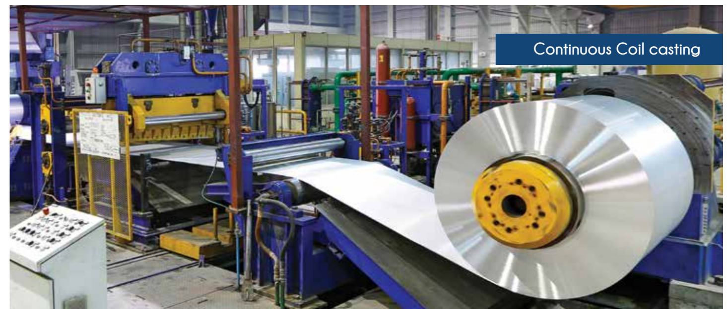
Continuous Coil casting